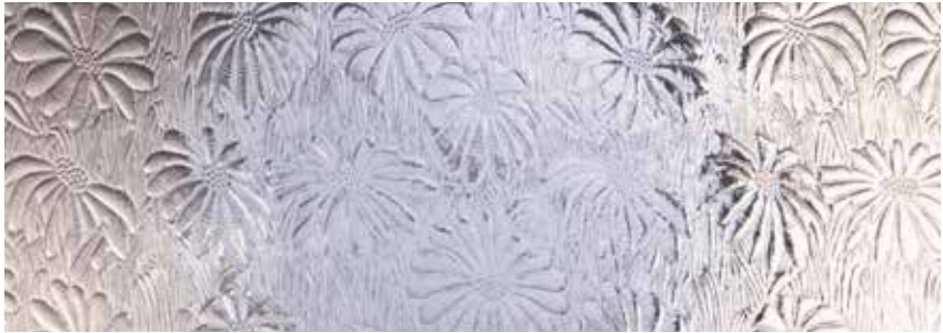
Mayflower™ Privacy Level 4