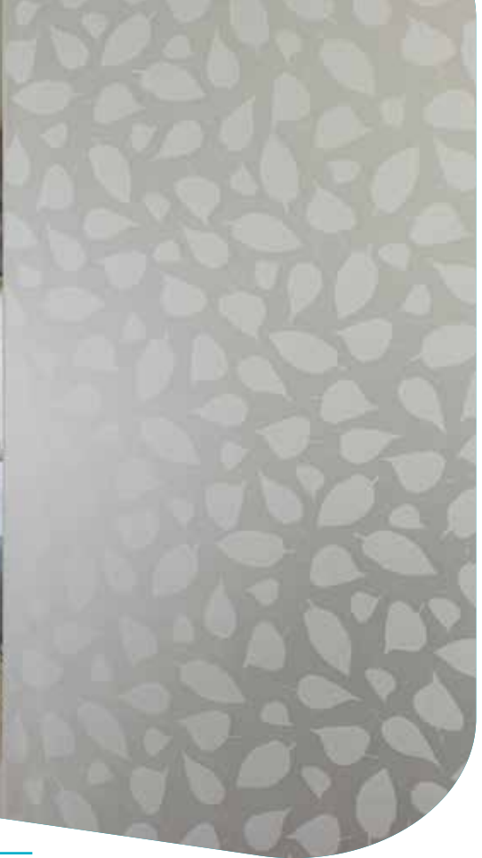
Bay™ Opal Privacy Level 5