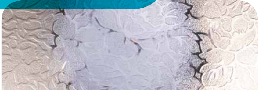
Florielle™ Privacy Level 4