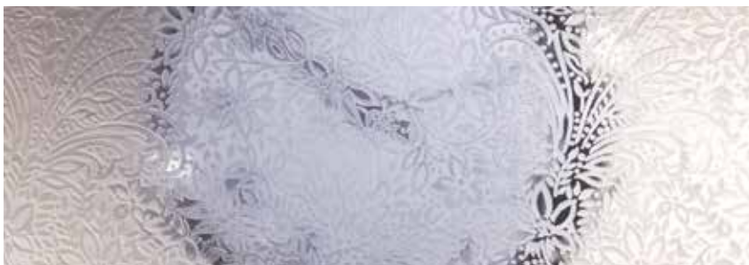
Chantilly™ Privacy Level 2