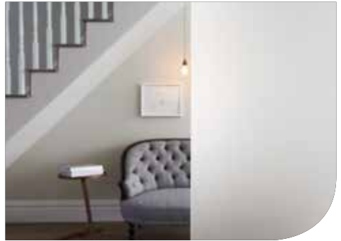
Pilkington Optifloat™ Opal Privacy Level 5